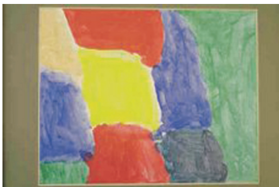
Figure 1. "Colors"

health, and a vehicle for nonverbal assessment. Each of these areas are now discussed.