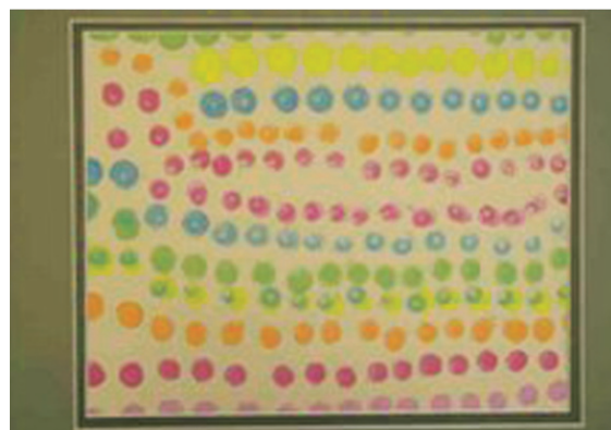
Figure 2. "Dots"

Telling of stories is a value held by African American older adults. 11 African American cli-