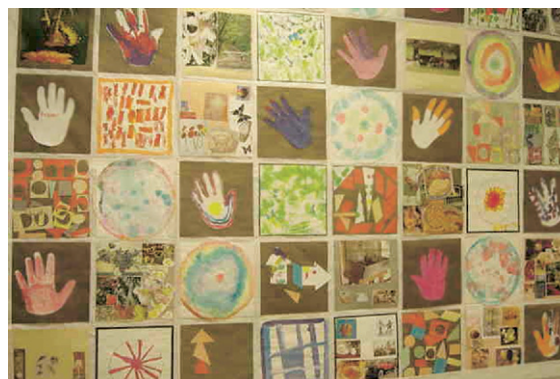
Figure 4. Group Artwork

The continuity of aging theory espouses that individuals incorporate lifetime coping strategies to adapt to changes in later years. 19 Art therapy is an adjunct that can be used to support coping skills when an older person faces loss of independence, loss of choices, or loss of health. Individuals with dementia, who may have lost verbal skills can express their feelings through use of bright colors and tactile interaction with painting materials. Art therapy can facilitate use of successful coping skills that have been accumulated throughout an older adult's life by enabling the expression of satisfaction in group work as well as individual self-reliance as the art is produced and shared with a community. The opportunity to support other group members can help clients identify and use their own strengths. Working together on a group project, such as a mural, can link people together, giving a sense of ownership and belonging (Figure 4, group artwork). The artwork is a visual reminder for participants that they can still accomplish and learn new things despite limited mobility or cognition.